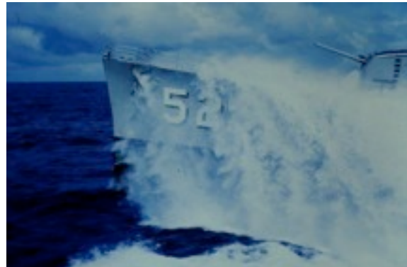
The late Steve Hammer captured the approach of USS Mullany (DD-528) in 1968.